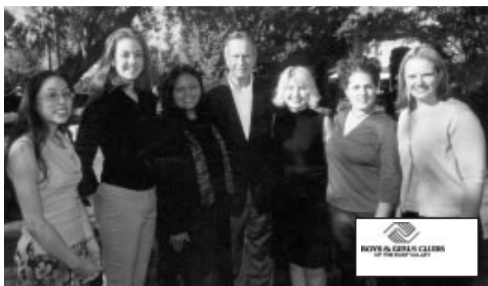
During a March visit to Phoenix, former President George Bush held a private audience at the Arizona Biltmore Resort with Youth of the Year winners and candidates from the Boys & Girls Clubs of the East Valley, Metropolitan Phoenix and Scottsdale. Recognizing each youth's achievements, President Bush commended each on their future plans to attend college and also urged them to continue spreading their positive community influence in the future.

GCJPR managed the event, which included speeches by each candidate, special talent acts and recognition of sponsors The Thunderbirds, Intel Corporation and the Chandler Compadres. Media placements included several articles about the nominees in The East Valley Tribune , East Valley Independent weekly editions and Spanish language newspapers.